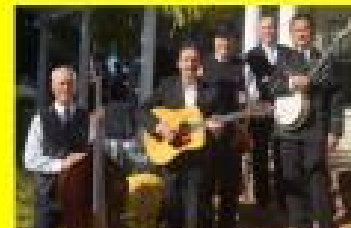
SONS OF THE SOUTH THURSDAY