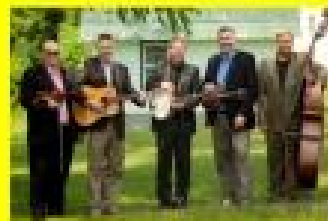
THE CHURCHMEN THURSDAY & FRIDAY