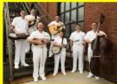
US NAVY BLUEGRASS BAND FRIDAY & SATURDAY