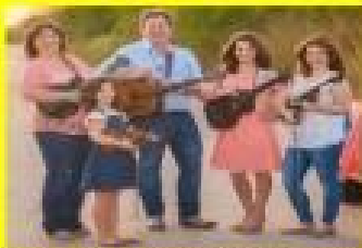
WILLIAMSON BRANCH THURSDAY & FRIDAY