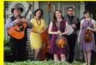
TRINITY RIVER BAND SATURDAY