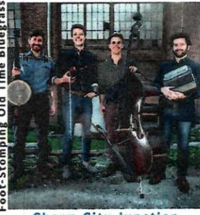
Foot-Stomping Old Time Bluegrass Charm City Junction