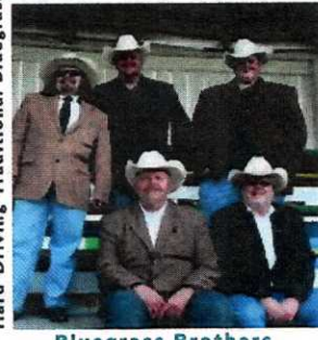
Hard-Driving Traditional Bluegrass Bluegrass Brothers

Presented By: The Upperco Volunteer Fire Company