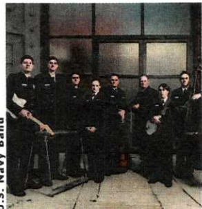
U.S. Navy Band Country Current