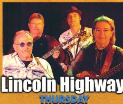
Lincoln Highway THURSDAY