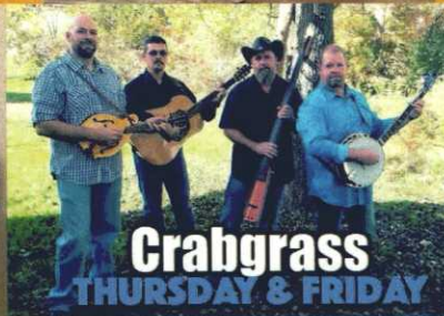
Crabgrass THURSDAY & FRIDAY