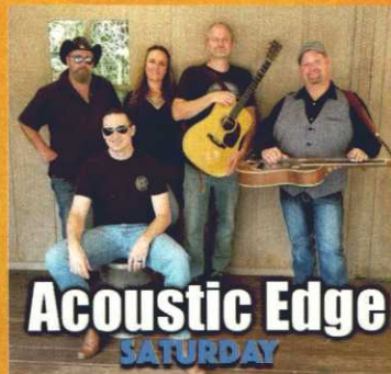
Acoustic Edge SATURDAY