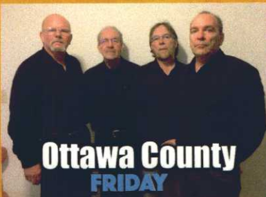
Ottawa County FRIDAY