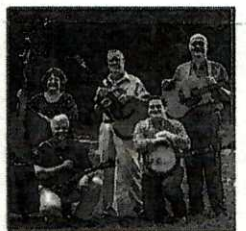
HEART OF DIXIE BLUEGRASS