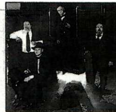
THE SOMETIMES LATER BAND