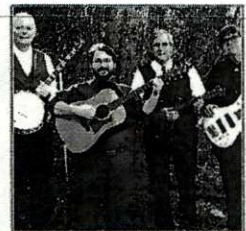
EVAN ROSE BAND