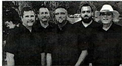
A DEEPER SHADE OF BLUE