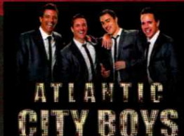
ATLANTIC CITY BOYS

PRIMITIVE CAMPING $12.00 30 AMP ELECTRIC $27.00 - (3 NIGHT MINIMUM) 50 AMP ELECTRIC $32.00 - (3 NIGHT MINIMUM) CAMPING OPENS MONDAY FEB 20TH - CLOSES FEB 26TH* DUMP STATION ON SITE