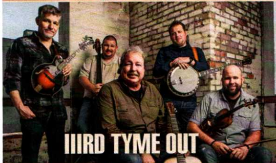
THIRD Tyme Out